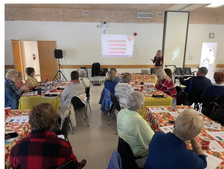
Colleen explained program features and answered questions.